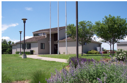
Corps of Discovery Welcome Center

In March, MSAC opened an office at the Corps of Discovery Welcome Center located just