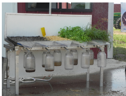
Large NRCS Rainfall Simulator at a Rangeland Tour in August

Randall Resource Conservation and Development of Lake Andes coordinated the purchase of wind erosion and tabletop rainfall simulators for education in the Charles Mix - Bon Homme counties/Lewis and Clark Watershed areas. MSAC contributed $200 toward the estimated $1,200 purchase price. Rainfall simulators illustrate the importance of healthy soils and their ability to encourage water infiltration thus reducing erosion and sedimentation into waterways.