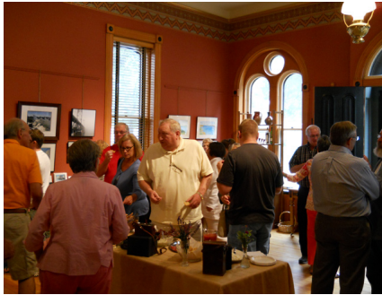
First Friday Event at Mighty Mo Photo Show

Several hundred county fairgoers took a look at the MSAC booth